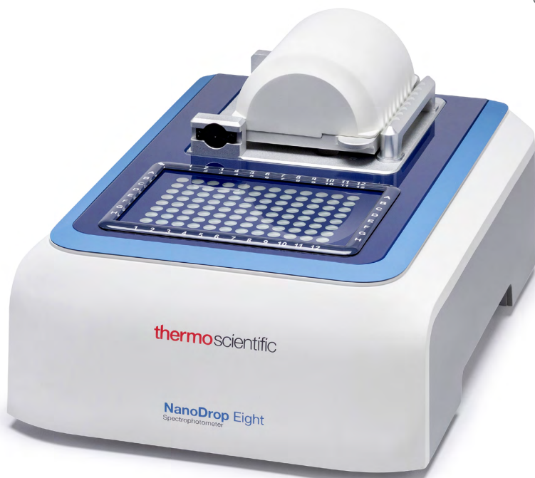
NanoDrop Eight 8-channel Microvolume UV-Vis Spectrophotometer

The NanoDrop Eight Spectrophotometer accurately measures a wide concentration range for protein samples using a 1 to 2 \mu\text{L} sample size. The auto-ranging pathlength technology on the NanoDrop Eight instrument pedestals allows life scientists to measure samples in an expanded concentration range, eliminating the need for error-prone dilutions. The 8-channel pedestal system on the NanoDrop Eight Spectrophotometer allows for simple implementation in high throughput workflows and includes a quick measurement time of about 15 seconds. The accuracy was evaluated by comparing several protein dilutions measured on the NanoDrop Eight Spectrophotometer with the NanoDrop 8000 Spectrophotometer as a reference. Reproducibility for each protein dilution was calculated from concentration data obtained by the NanoDrop Eight instrument.